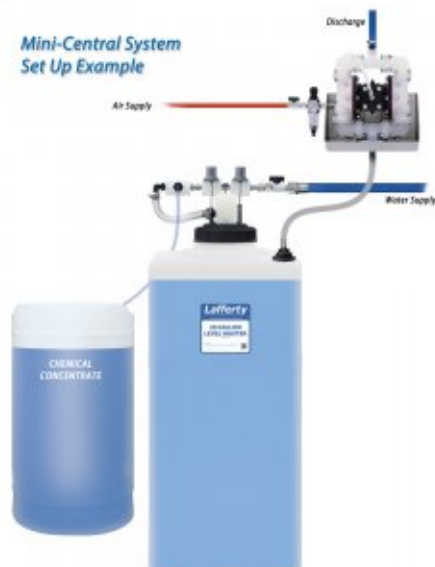
Mini-Central System Set Up Example