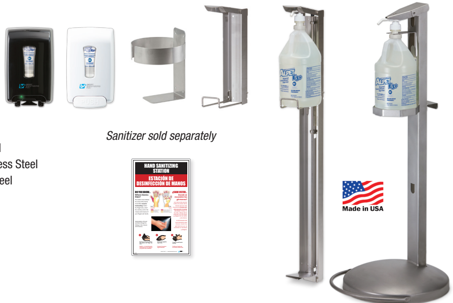
Sanitizer sold separately