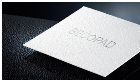
Water throughput BECOPAD range

BECOPAD depth filter medium is very low cationic. This means there is only a minor charge-related adsorption during the filtration. Valuable substances are not adsorbed and remain in the filtrate. The chemical resistance and the mechanical stability are exceptionally high.